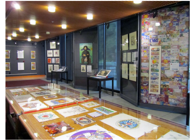
"Songs of Our Own," looking South in Dead Central