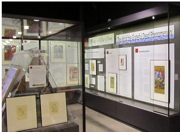
The Opening Exhibit Cases for "Songs of Our Own"